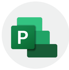
Project for the web Project Online